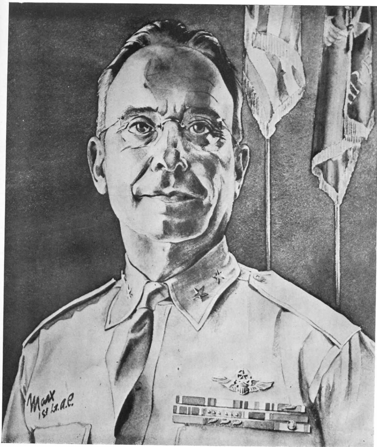
Commanding General: MAJOR-GENERAL LEWIS H. BRERETON